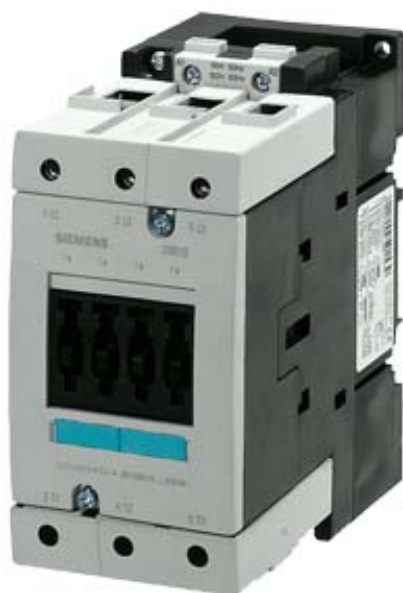
CONTACTOR, AC-3 30 KW/400 V, DC 24 V, 3-POLE, SIZE S3, SCREW CONNECTION