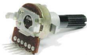
Horizontal Type, Dual Unit, P.C.B. Terminal